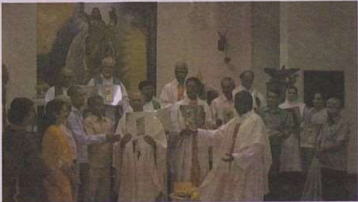
Release of the first copy of the Gujarati New Testament in Braille